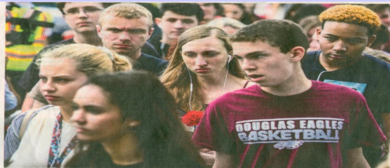
Classes resumed on Wednesday at Marjory Stoneman Douglas High School, with extra counselors and therapy dogs on hand.

The New York Times, which I check online about daily, had a front page article on this hot story, "Returning to school where 3 classmates died" and a catching photo of the high school students in Parkland Florida. It was the first day of school in two weeks after the shooting that killed 17 teachers and students. Now there is talk of having armed guards for schools and possibly churches where people have been murdered by guns. What if our young people took the issue of climate change and the environment to state and national leaders and representatives? They might take notice, especially when young people who can vote support research and change.