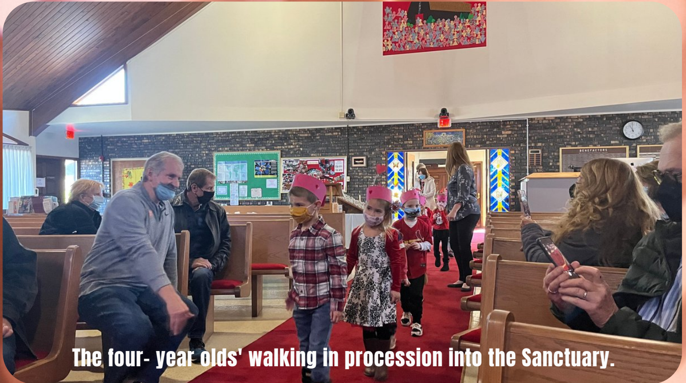
The four- year olds' walking in procession into the Sanctuary.