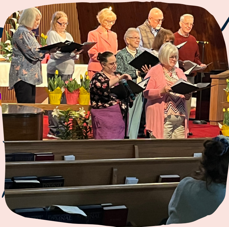
"Celebrate the Savior" Worship Choir